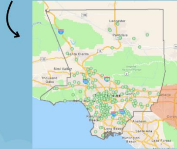
Cooling Center Map